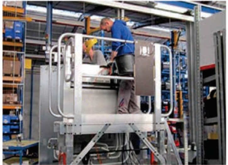
Project reports customised solutions

You may get all your needs met thanks to Y-Access Manufacturing consulting experience. From analysis to design, implementation, and services, our professionals will handle your concerns in a professional manner and have years of experience.