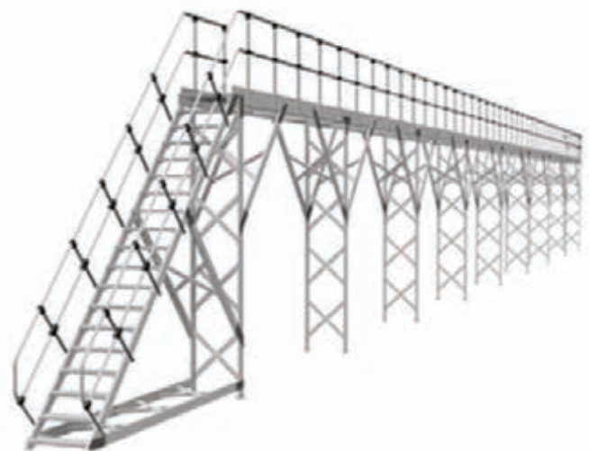
Bus, trains & commercial vehicles